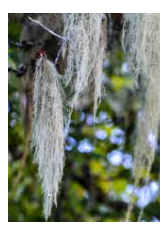
Witch's Hair Lichen