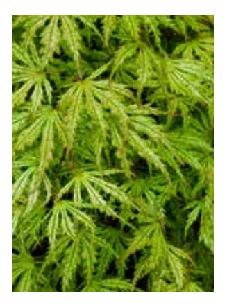
'Sister Ghost' Japanese Maple

Acer palmatum 'Sister Ghost' Sapindaceae