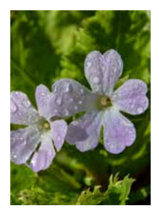
No common name