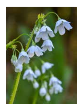
Alpine Bells Primula matthioli Primulaceae