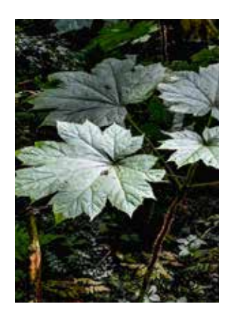
Devil's Club Oplopanax horridus Araliaceae

Southeast Alaska is rich with native plant material; the Arboretum showcases only a slight number of species as part of its overall collection.