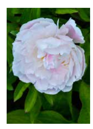
Chinese Peony Paeonia lactiflora Paeoniaceae