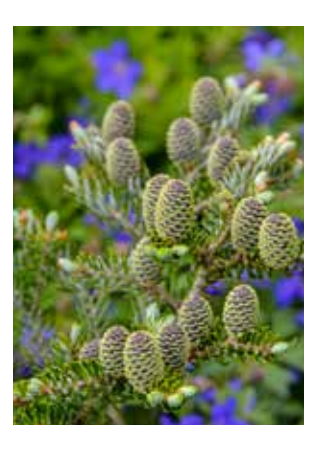
'Silberlocke' Korean Fir