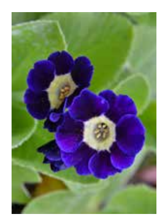
Bear's Ear Primula auricula Primulaceae

The Arboretum houses the largest documented collection of them in North America, and in 2012 was recognized as the Nationally Accredited Collection™ for the genus by the Plant Collections Network of the American Public Gardens Association.