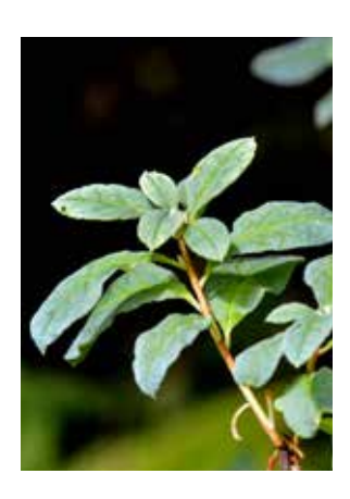
False Azalea Rhododendron menziesii