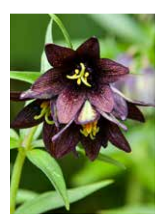
Chocolate Lily Fritillaria camschatcensis Liliaceae