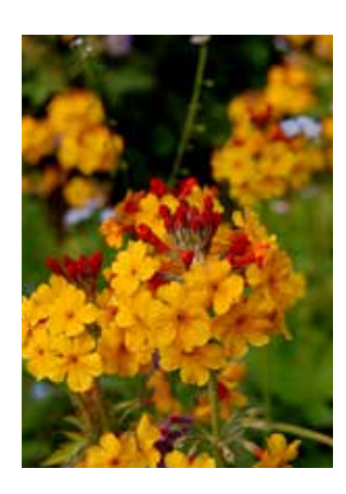
No common name