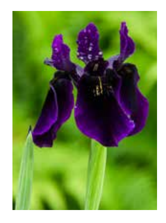
Black Iris Iris chrysographes