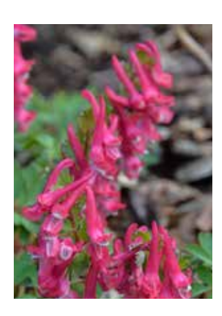
'Beth Evans' Fumewort Corydalis solida 'Beth Evans' Papaveraceae